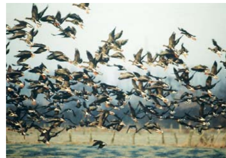
The mining lamp is a real eye-catcher day and night (above left). Arctic geese approaching Lower Rhine (left). The Biefang water mill makes a tranquil break for any type of tour (right).

sands and long poplar avenues are the varied result of this geological rarity in the predominantly agricultural surroundings.