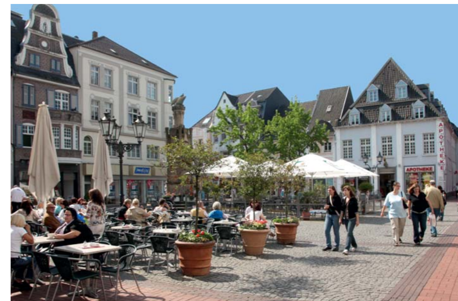
far top: Luise Henriette, top: Altmarkt

Enchanted corners, winding alleys and old buildings: The old town is well-known far beyond the city limits. The best way to experience its charm is on foot. Our tour begins at the Kastell (1) , the town centre’s largest square. Here you will find the Kreisständehaus (2) , a Renaissance building dating back to 1898. Passing the Castle (3) on the left, we make our way to St. Josef catholic church (4) built in 1871. The Kindergarten (5) on the other side was