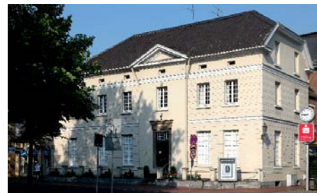
The Peschkenhaus at Neumarkt

At the turn-off to Friedrichstrasse (14) is the Gänsebrunnen (15) (goose fountain). The houses here and on Pfefferstrasse were lovingly reconstructed or rebuilt in line with urban redevelopment. On the way back through Burgstrasse to Kastell we again cross Haagstrasse. House number 7 in Dutch Baroque style is the present day County Court (16) – buildings number 24 and 26 (17) are also worth seeing.