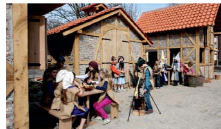
At the Grafschafter Musenhof (left) kids can playfully learn about the medieval times. The playground right next to it invites even the youngest to play (right).

goats, chickens, rabbits and many other farm animals are looking forward to your visit. Entertainment is also offered in winter, when it snows and freezes: That's when the Rodelberg invites you to sledging at the theme park and the giant indoor ice rink invites you to go ice skating. Raining? A fine alternative is a visit to the