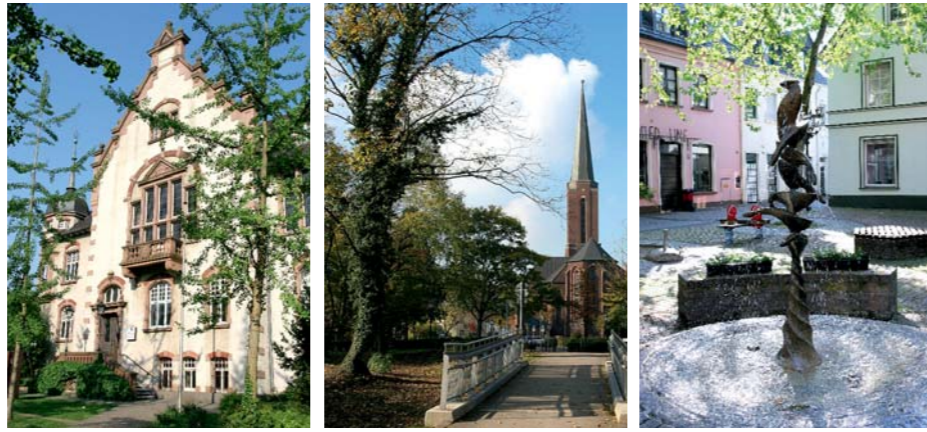
Picturesque all over: from the Kreisständehaus to the catholic church, to the Gänsebrunnen (above), images of Steinstrasse (below)

Back in the pedestrian zone, Steinstrasse leads further into the old town. On the left, town houses from the 17th/18th century surround the Altmarkt (13) (old market) with the Prussian monument. Here you will find many inviting pubs and restaurants – this is where people meet up in Moers. If you're looking to take a break you can't go wrong here. Then we continue past the pharmacies to Kirchstrasse. "Rösgen" house no. 38 was built in 1677. Today people can take delight in the classical plaster façade.